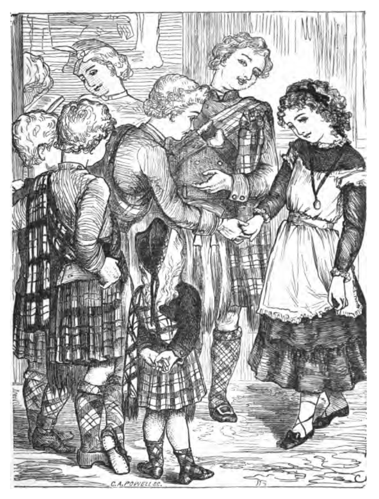
THE EIGHT COUSINS. - Page 10.